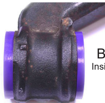
B bush Inside of arm