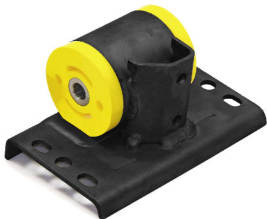
Figure 1 - Fitted Image of Gearbox Mount Bush