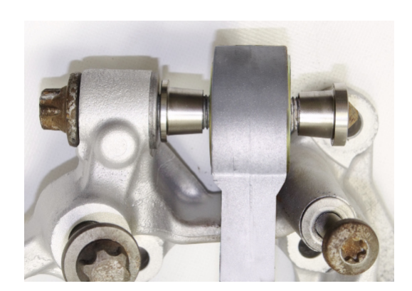
Figure 3 - Fitted