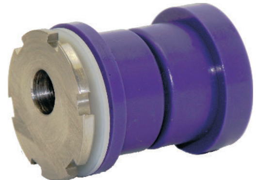
Fig 2. Assembled view.