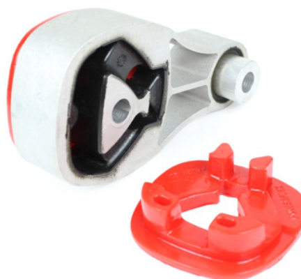
Figure 1 - Fit Inserts into voids.