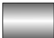
Stainless Steel Sleeve