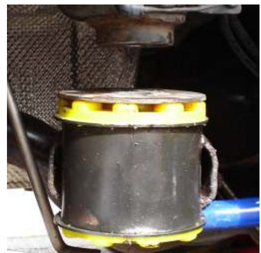
Fig 2. Rear mount - OE washers shown.