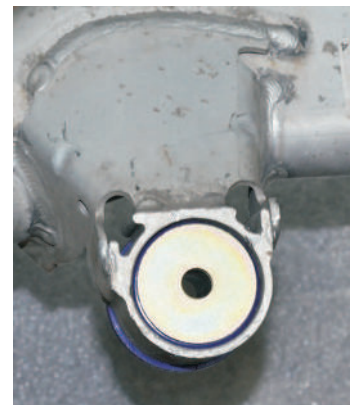
VIEW FROM FRONT