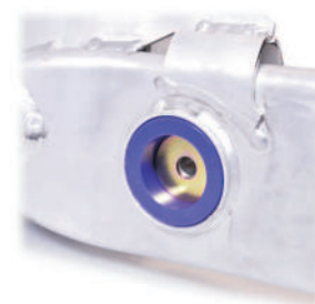
Washer goes here (Rear of car)