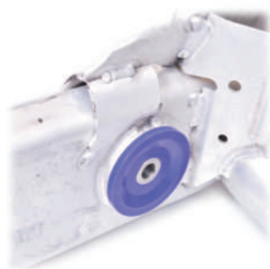
Front of car (Diff)