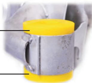
Normal view on car