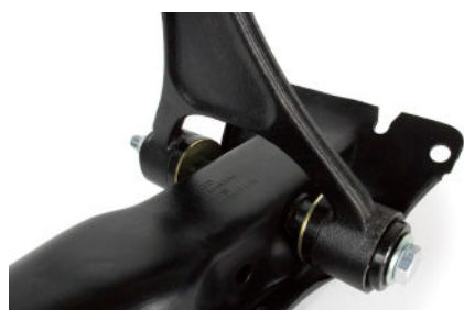
Figure 1 - Fitted Image