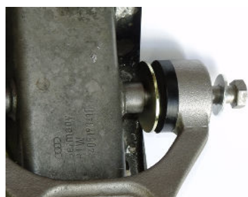
Figure 1- Fitted Image