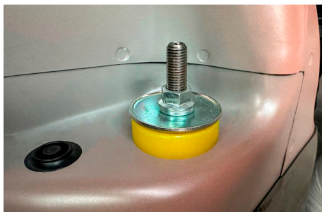
Figure 1 - fitted image