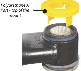
Figure 1 - diagram showing how polyurethane part A fits