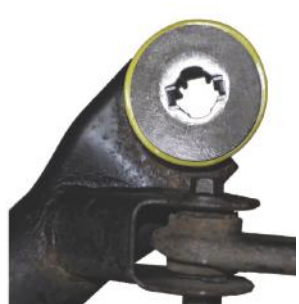
Figure 2 - diagram showing how polyurethane part B