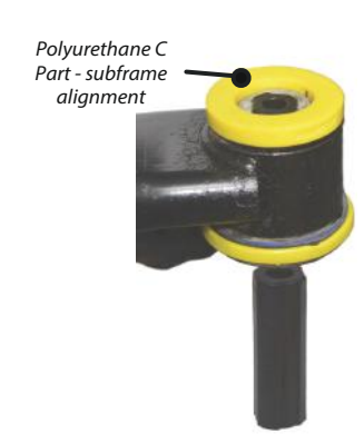
Figure 3 - diagram showing how polyurethane part C fits