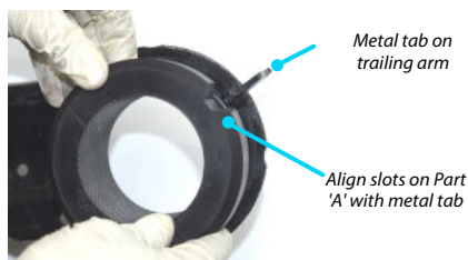
Figure 3 - Align slots on part A with welded tab on trailing arm