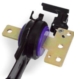
Figure 4 - fitted image of PFR19-1917