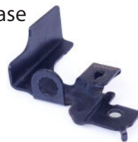
Figure 1 - Retain small metal bracket from original bush for refitting to new bush