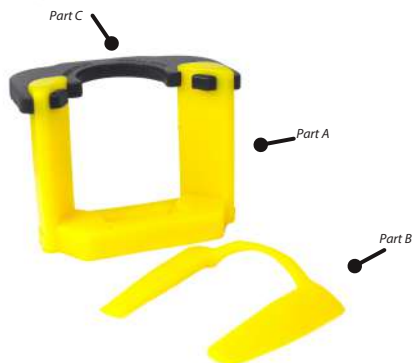
Figure 3 - showing how A and C polyurethane inserts should fit together