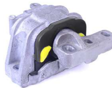
Figure 4 - showing all polyurethane inserts fitted inside the upper engine mount