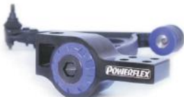
Left-hand wishbone fitment shown