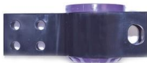
RIGHT HAND OF CAR