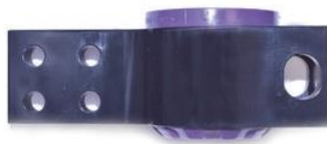
RIGHT HAND OF CAR