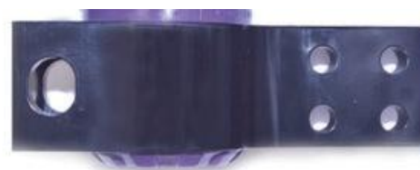
LEFT HAND OF CAR