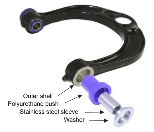
Figure 1: Exploded view.