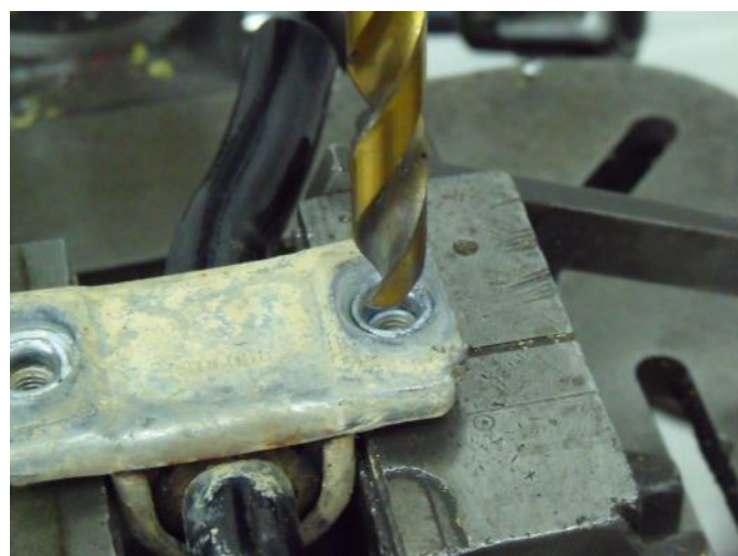
Figure 1 - how to remove the swaged section from the bracket