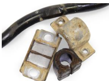
Figure 3 - the anti roll bar, brackets and the original rubber bush