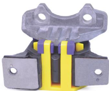
Figure 4 - showing how the two polyurethane parts will fit together inside the engine mount