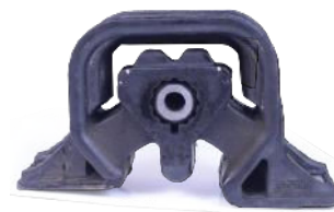
Figure 1 - profile of the engine mount that fits this bush