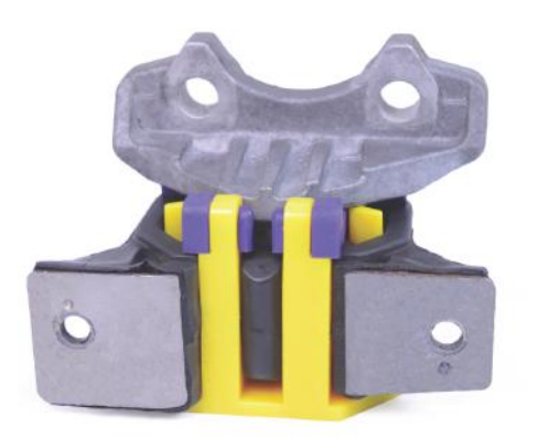
Figure 4 - showing how the two polyurethane parts will fit together inside the engine mount

7. Tension all hardware to manufacturers recommended torque settings.