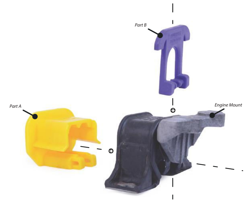
Figure 3 - exploded diagram showing where the two parts fit inside the engine mount

Figure 2 - showing how the two polyurethane parts will fit together