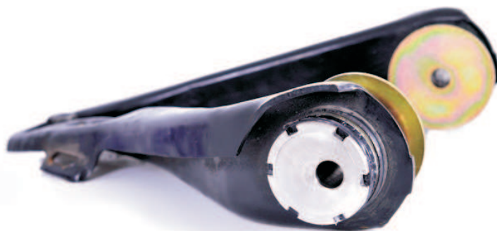
PFF60-301G in maximum camber position ready to fit back onto car.