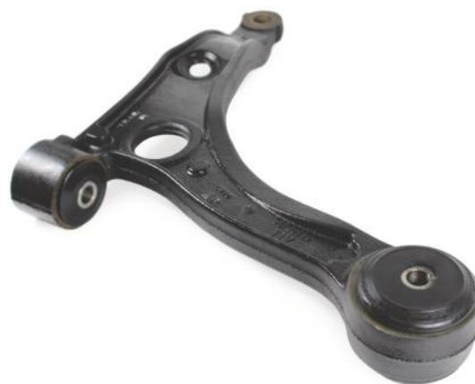
Figure 2 - showing all polyurethane bushes fitted in to the arm.