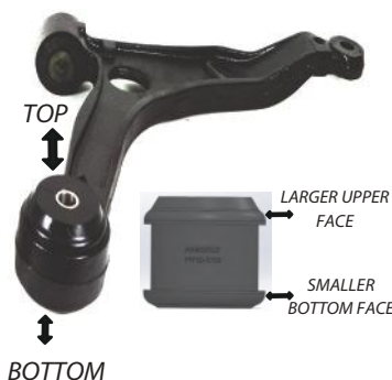
Figure 4 - showing the top and the bottom side.