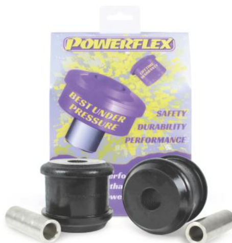
Figure 1 - showing the contents of the box