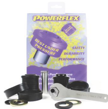
Maximum Positive Caster