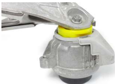
Figure 6 - 5-4021 Orientation