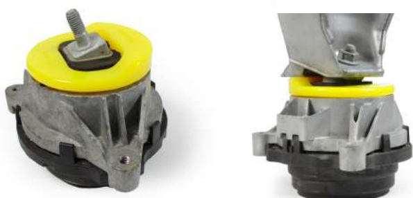
Figure 5 - 5-4020 Orientation