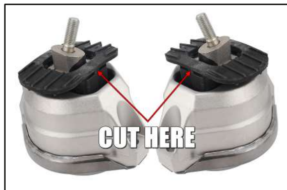
Figure 7 - Cut Line for Buffer Flap