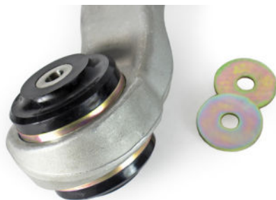
Figure 1 - Fitted Image