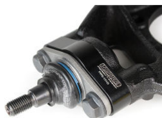
Figure 1- The roll centre adjuster unit without washer