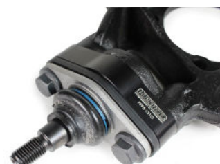
Figure 2- The roll centre adjuster unit with washer