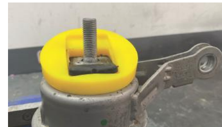
Figure 3: slide one side of bush under a rubber flap