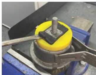
Figure 5: Seat the flaps on top of the bush securely