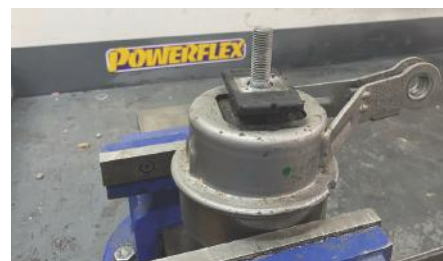
Figure 1: Secure mount in vice