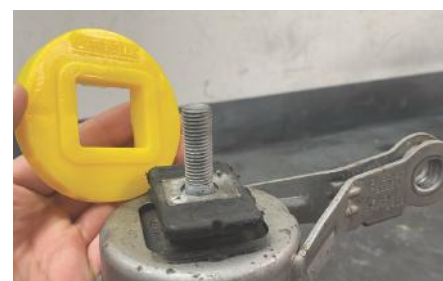
Figure 2: Fit bush with logos facing downwards