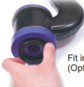
Fit insert (Optional)