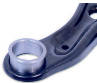
Fit shell in from radius side