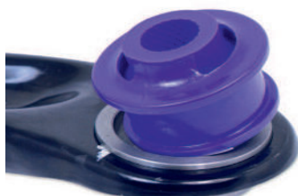
Align slots and push bush into shell