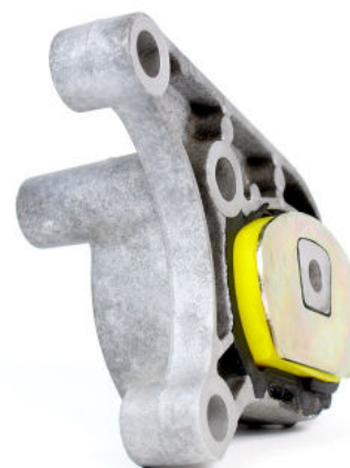
Figure 2: Attach washer to top of insert