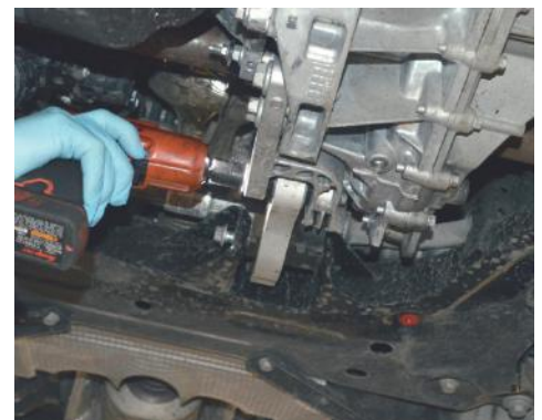
Assembling the Powerflex Lower Torque Mount