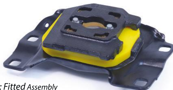
Figure 2: Fitted Assembly