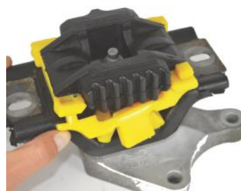
Figure 3 - showing which side to fit first, number 1 and then number 2.