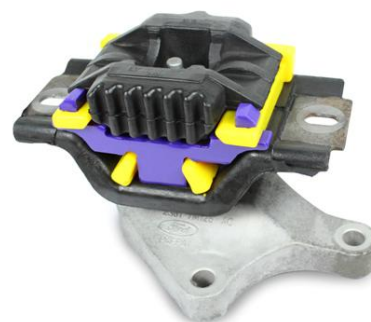
Figure 1 - showing all polyurethane inserts fitted inside the gearbox mount