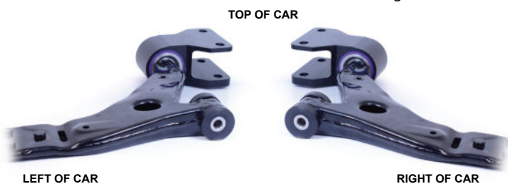
Figure 4 - Right-hand and left-hand bush and bracket assembly