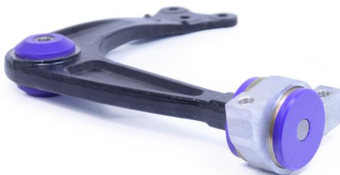
Figure 3 - fitted image showing the polyurethane bush and the metal sleeve inside the bracket and arm