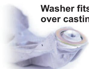
Washer fits over casting